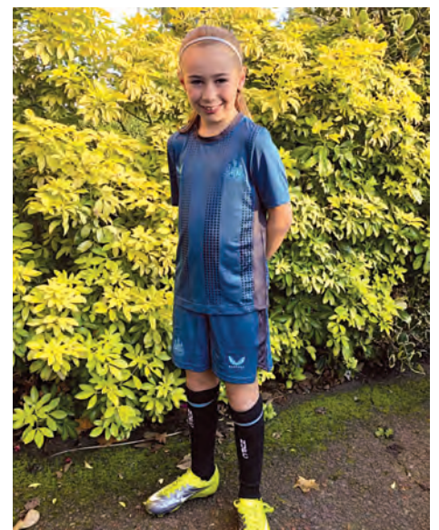
Year 4 footballers at NHSG