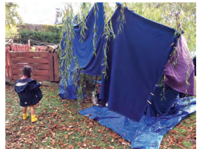
Building a Sukkah