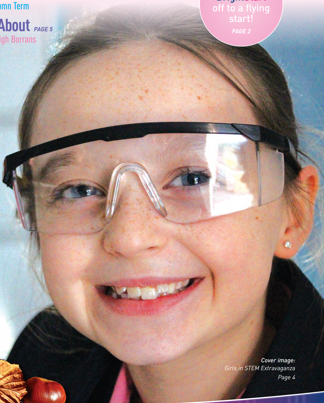
Cover image: Girls in STEM Extravaganza Page 4