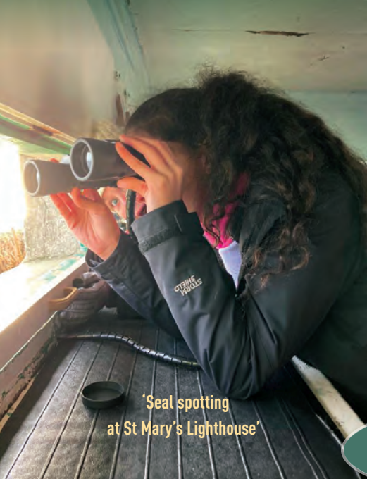
'Seal spotting at St Mary's Lighthouse'