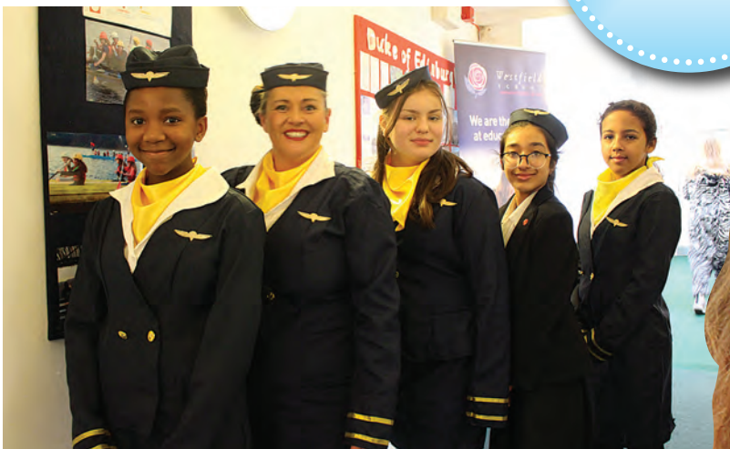
The air stewardesses - Miss B and Upper 3 represented 'Internationalism'.